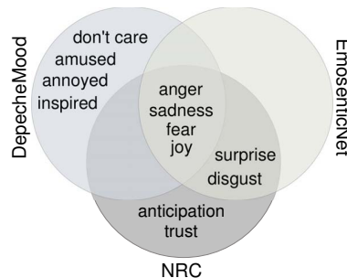
Figure 2: Intersection of the lexica.

The first challenge we faced was the wide variety of emotions available in each word-emotion lexicon. While NRC relies on Plutchik’s wheel of eight basic emotions, EmosenticNet includes Ekman’s six basic emotions, and DepecheMood [17] includes eight mood-related words based on Rappler’s mood meter. Thus, in order to compare the inter-lexicon agreement, we first extracted the intersecting emotions – anger, sadness, fear, and joy (see Figure 2).